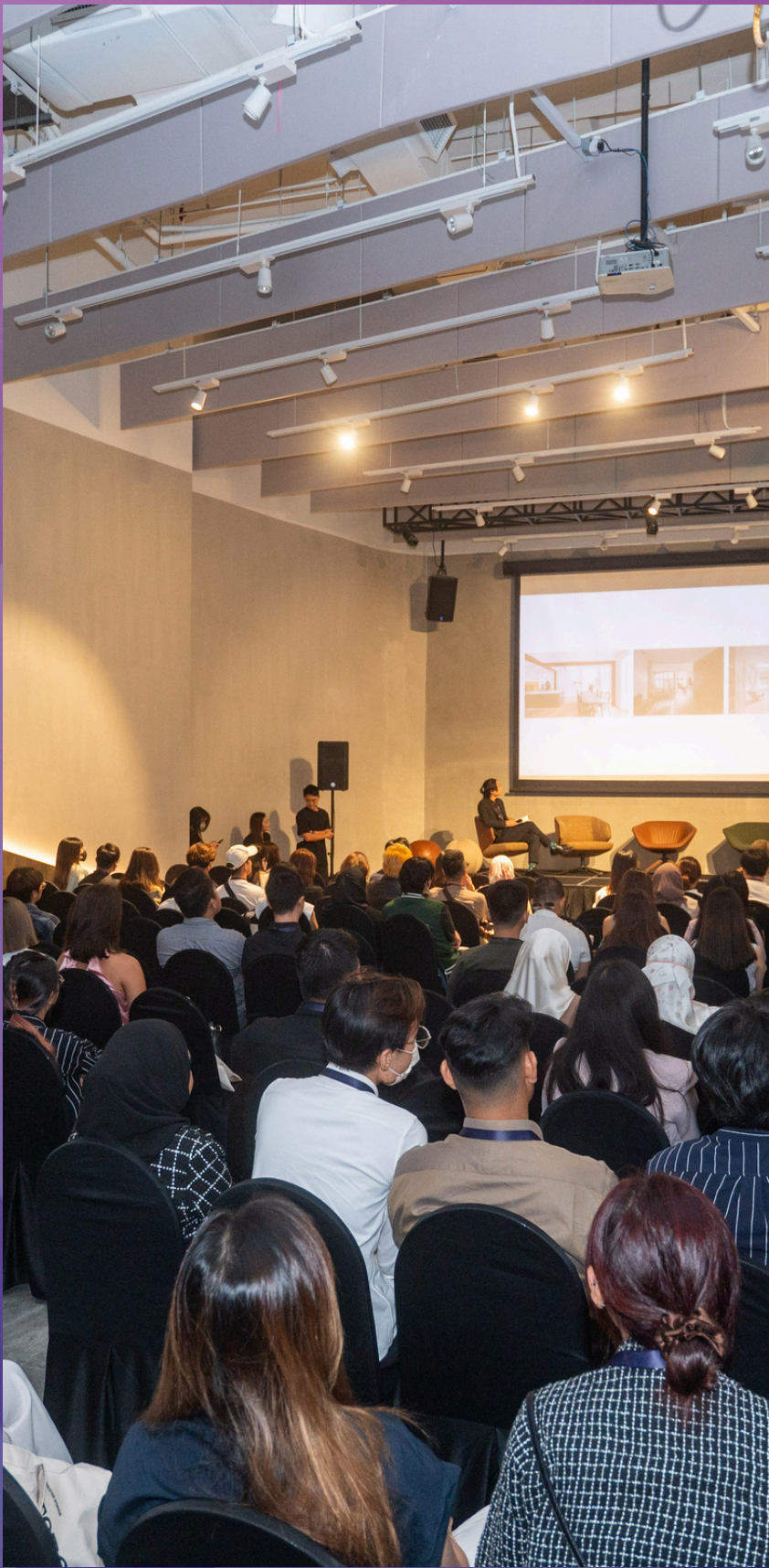
Industry Event Passes