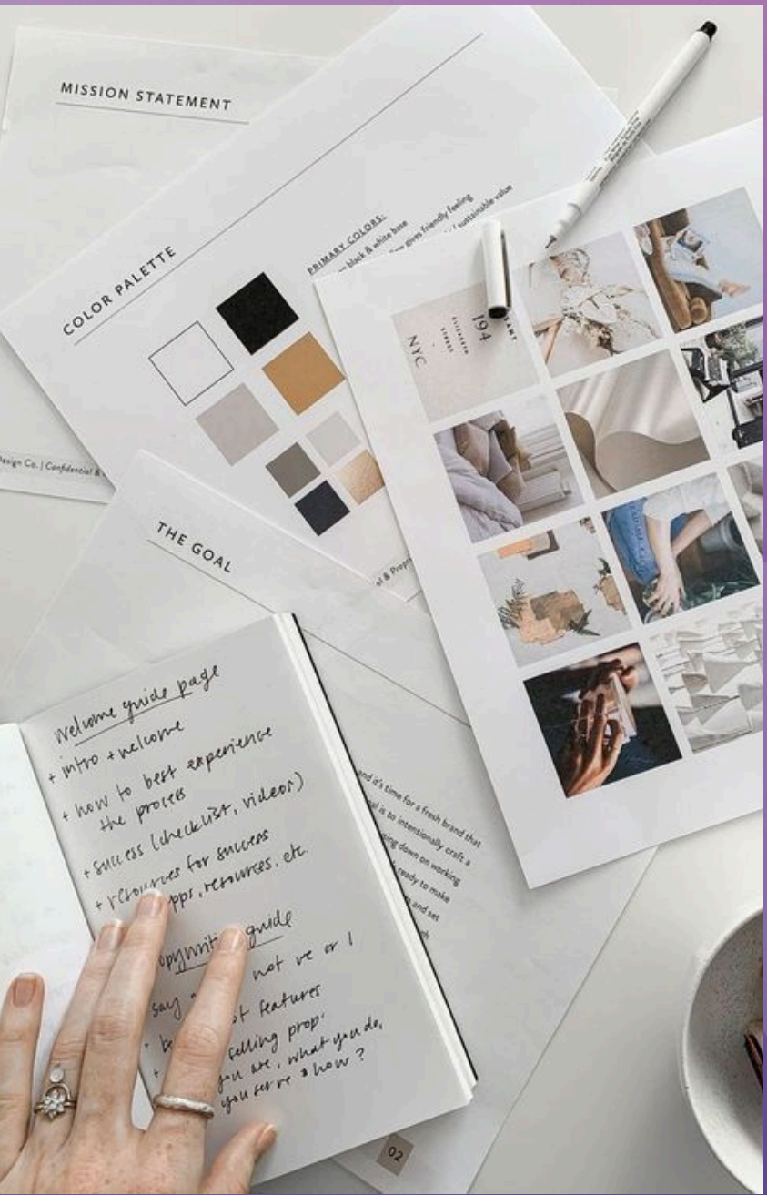
Career Placement Opportunities