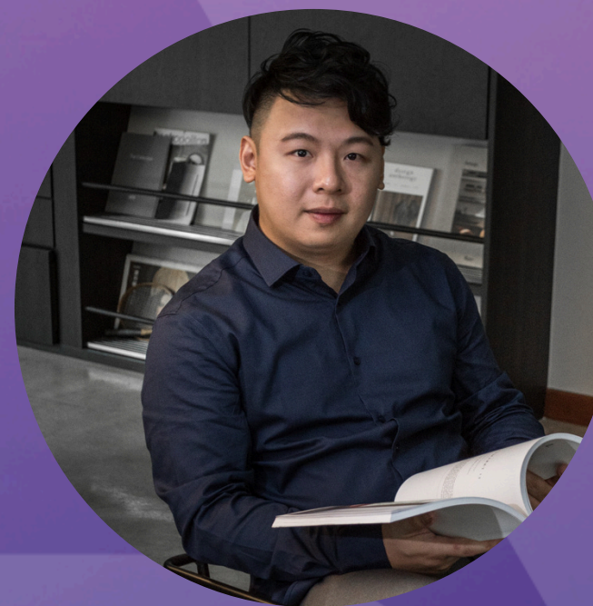
MIXY OOI VAULT DESIGN LAB