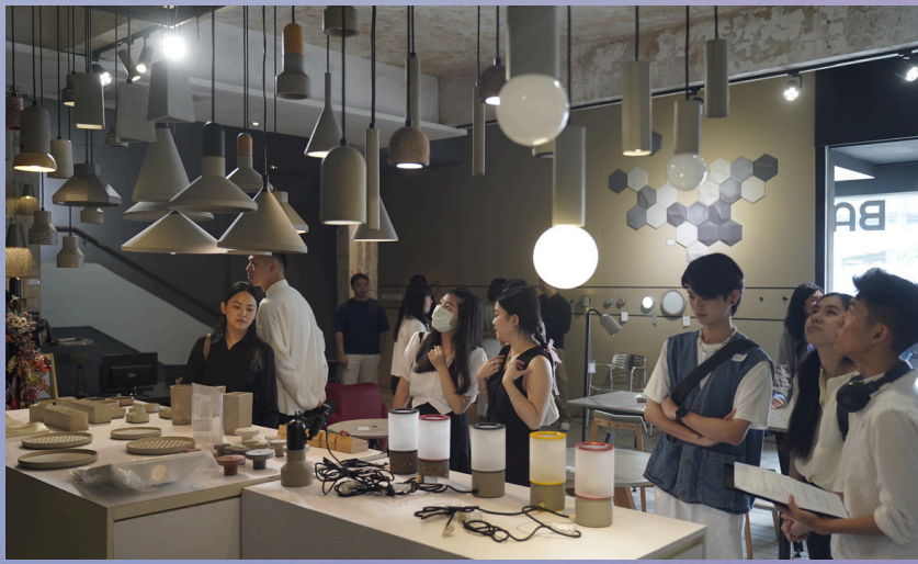
DesignVoyage Field Trips