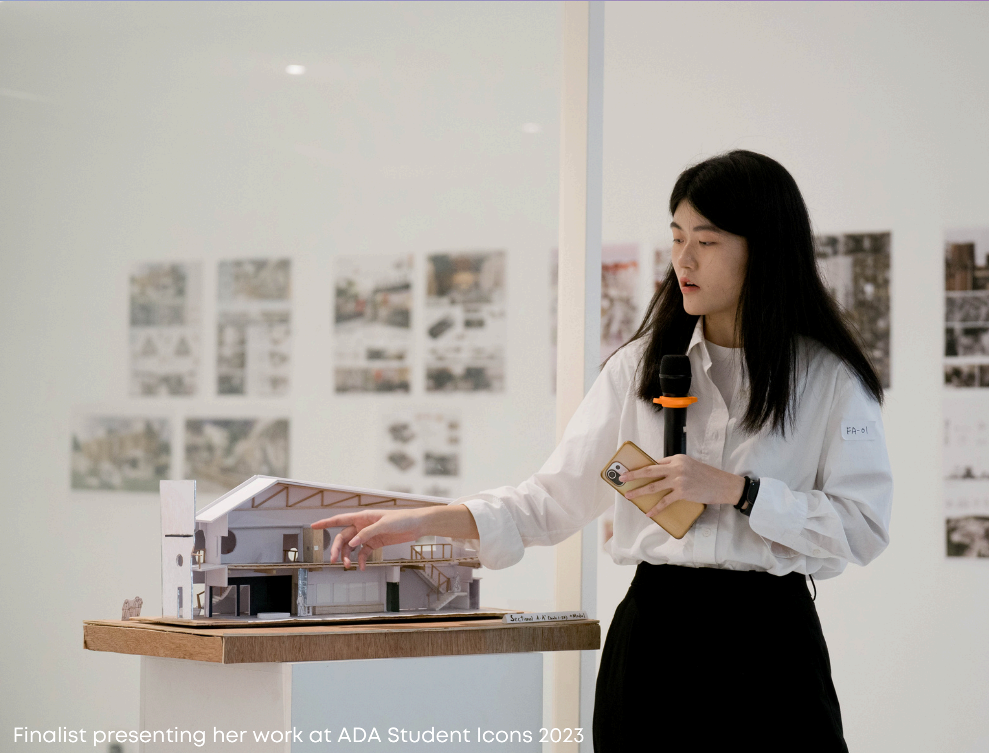
Finalist presenting her work at ADA Student Icons 2023

This competition invites creators to redefine boundaries and inspire a new era of design fusion by showcasing innovative designs that harmoniously blend heritage with contemporary elements.